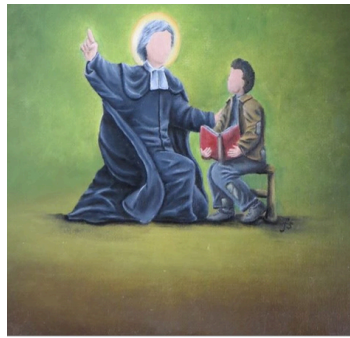
"Il faut qu'il grandisse et que moi, je diminue" (In 3,30)

My answer is expressed through the drawings: During my first profession of vows, following my novitiate in the Philippines, I felt - and still feel - a profound admiration for our founder, Saint John Baptist de La Salle. Wishing to express this sentiment through a drawing, I sketched De La Salle kneeling, thus showing his surrender and humility, in order to be grounded and closer to the needs of the child. Opposite, the student is depicted sitting on a stool, symbolizing that - through education: the book - the student grows. One notices that Saint John Baptist de La Salle's hand is raised towards the heavens, reminding us that in his meditations, De La Salle urges us to become aware of our role as intermediaries between the child and God.